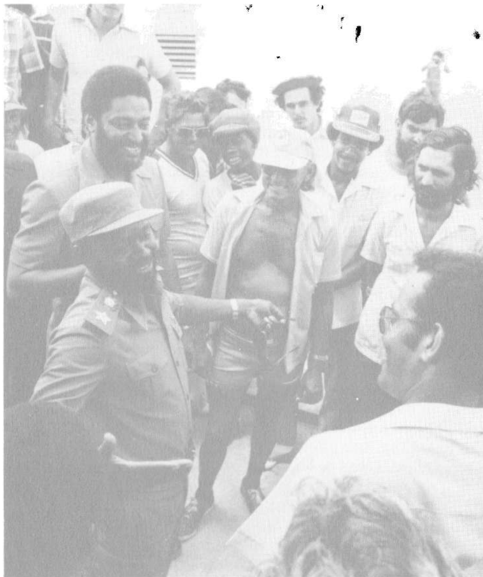
President Machel of Mozambique, accompanied by Maurice Bishop, talks to Cuban workers at the Point Salines International Airport site.

Dear Comrades if it must be you speak no more with me nor smile no more with me nor march no more with me then let me take a patience and a calm for even now the greener leaf explodes sun brightens stone and all the river burns. Now from the mourning vanguard moving on dear Comrades I salute you and I say Death will not find us thinking that we die.